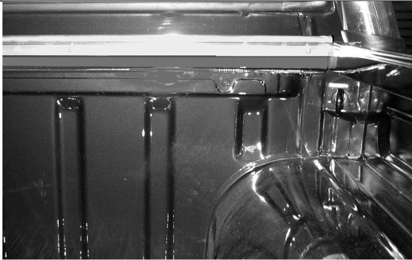
Figure 1: Placement of aluminium rope track. Ensure channel is above the tub's top edge.