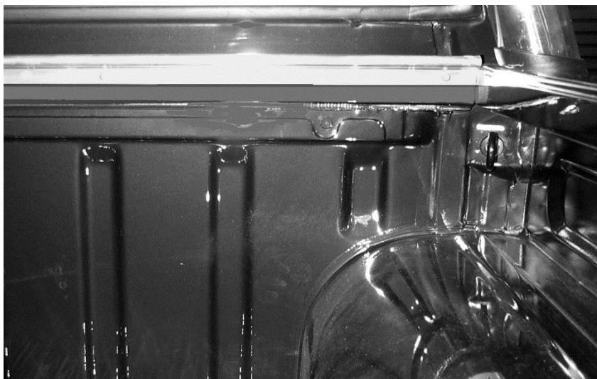
Figure 1: Placement of aluminium rope track. Ensure channel is above the tub's top edge.

NOTE: All SIDE measurements are to be taken from the TOP INSIDE EDGE of the tub.