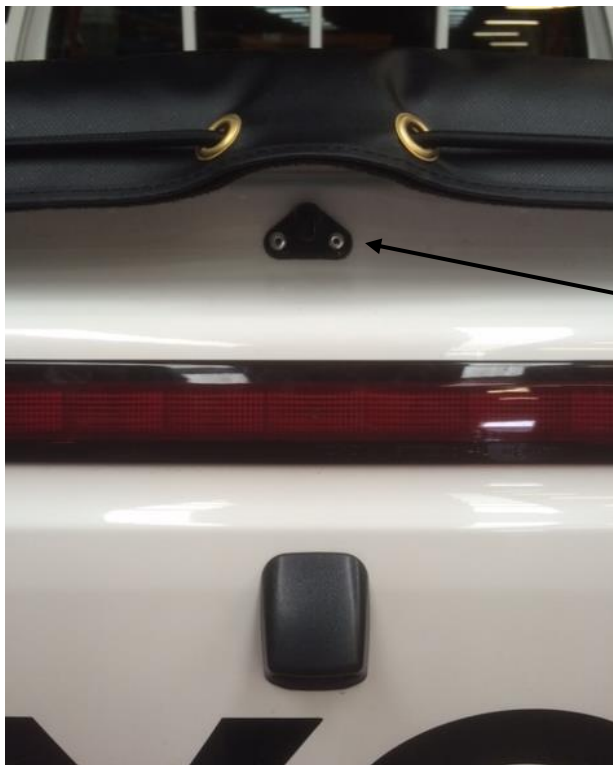
Figure 3: Rivet the triangle hook in the centre of the tailgate.